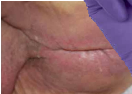
Patient with improvement noted on Day 4