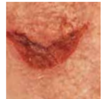
Incontinence-Associated Dermatitis (IAD)