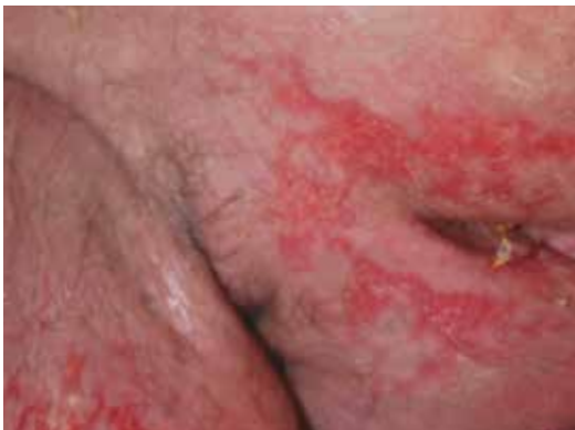
Patient with skin damage on Day 2

A clear improvement on traditional treatment options, 3M™ Cavilon™ Advanced Skin Protectant uses a unique polymer-cyanoacrylate system to deliver ultimate protection and prevention – even in the most challenging circumstances.