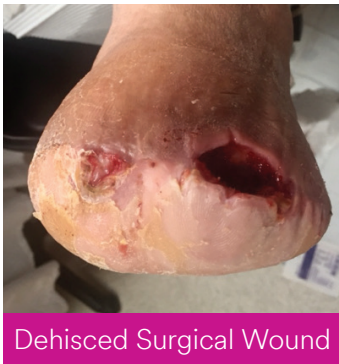
Dehiscent Surgical Wound