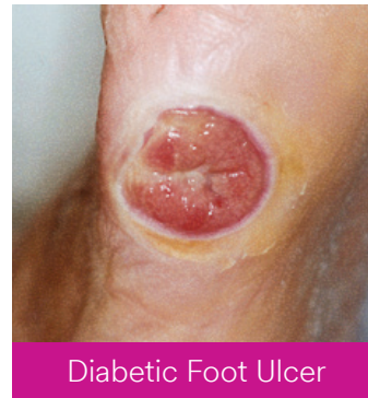
Diabetic Foot Ulcer