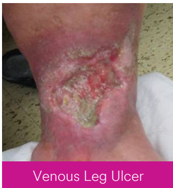
Venous Leg Ulcer