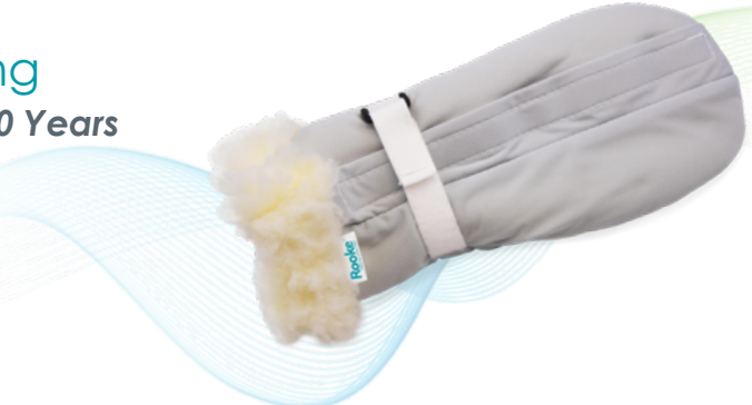
Product #RV-51 | $68